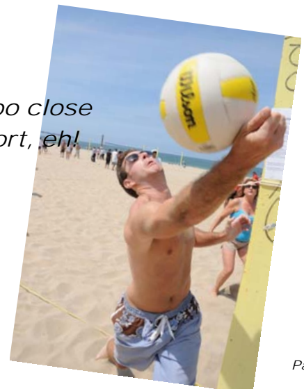
A little too close for comfort, eh!