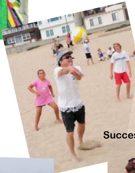
Success or Defeat?